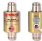
Lightning Arrestor LABH350NN (Sold Separately)