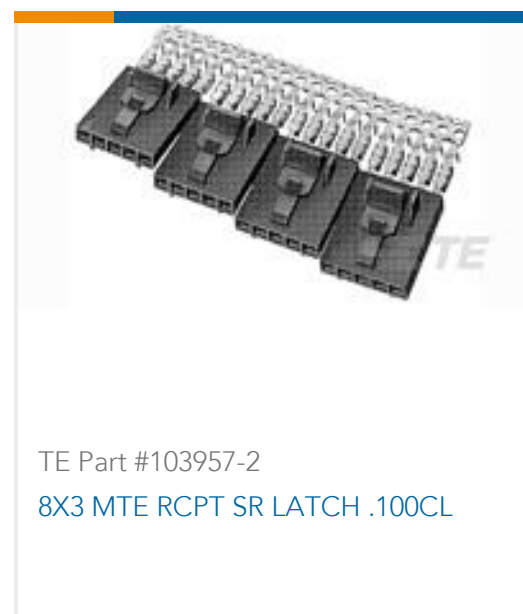
TE Part #103957-2 8X3 MTE RCPT SR LATCH .100CL