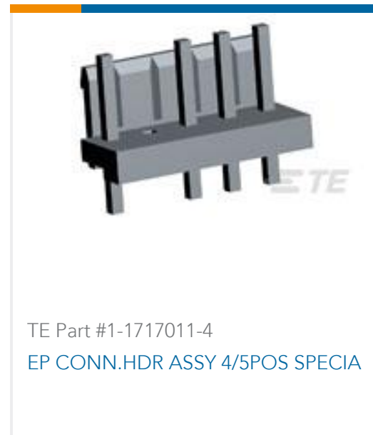
TE Part #1-1717011-4 EP CONN.HDR ASSY 4/5POS SPECIA