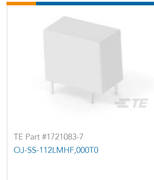
TE Part #1721083-7 OJ-SS-112LMHF,000T0