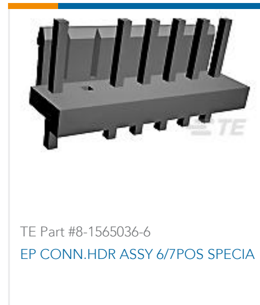
TE Part #8-1565036-6 EP CONN.HDR ASSY 6/7POS SPECIA