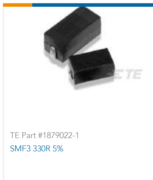
TE Part #1879022-1 SMF3 330R 5%