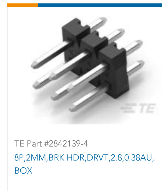
TE Part #2842139-4 8P,2MM,BRK HDR,DRVT,2.8,0.38AU, BOX