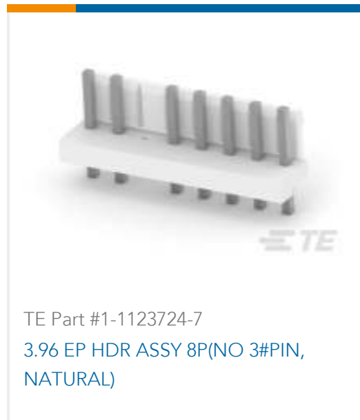
TE Part #1-1123724-7 3.96 EP HDR ASSY 8P(NO 3#PIN, NATURAL)