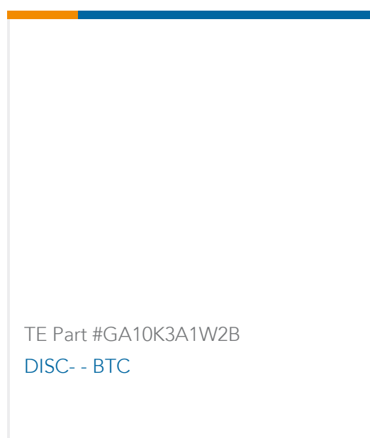
TE Part #GA10K3A1W2B DISC - BTC