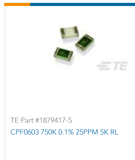
TE Part #1879417-5 CPF0603 750K 0.1% 25PPM 5K RL