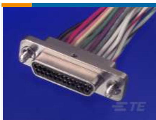
TE Part #1532179-3 M83513/03-A03N, MCKS-N1-B-9P6G9-18.0