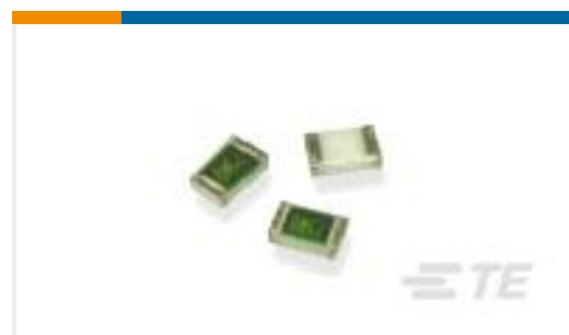
TE Part #1676276-2 RN 0805 287R 0.1% 10PPM 1KRL