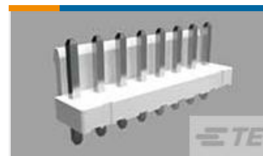
TE Part #1744037-3 03P EC PWR.200 CL HDR ASSY VRT