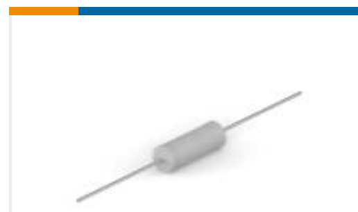
TE Part #4-2176412-8 5W XSM M/OX 5% 470R