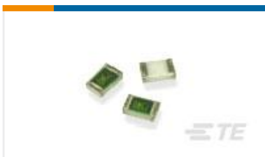
TE Part #1676217-2 RN 0805 19K6 0.1% 10PPM 1KRL