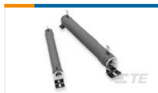
TE Part #2-1879450-5 TE 500W 100R 5% Bracket