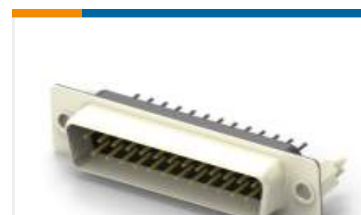
TE Part #2301835-1 AMPL PLUG HD20, VERT, 25P, B/L, 4-40 INS