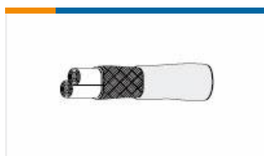
TE Part #943829-000 55A1111-22-9-9CS2275