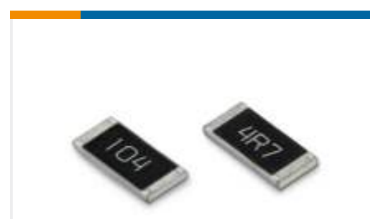
TE Part #1-2176456-1 CPF 0603 1R27 0.1% 25ppm 1K RL