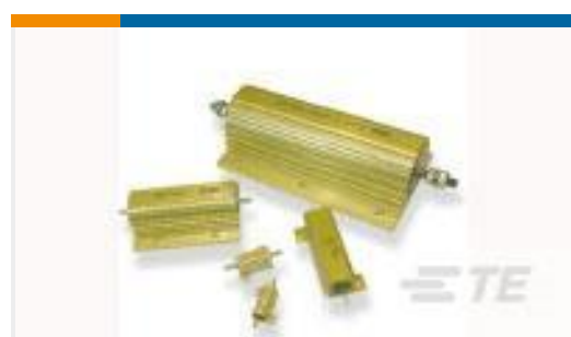
TE Part #2-1630024-1 HSC250 R47 5%