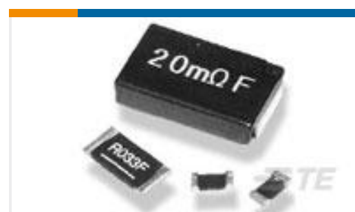
TE Part #4-1879378-4 TLR 2512 2.0W R010 1% 100PPM 2K RL