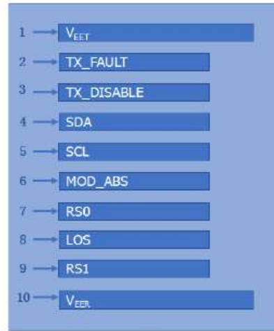
Bottom of Board