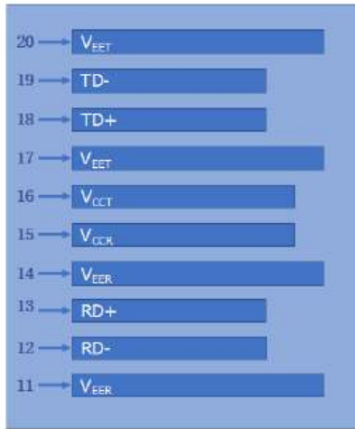
Top of Board