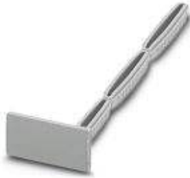
Terminal strip marker carrier, height-adjustable, for end brackets CLIPFIX 15, CLIPFIX 35 and CLIPFIX 35-5, can be labeled with BMK...20 x 8 labels, or directly with the M-PEN or X-PEN

Please be informed that the data shown in this PDF Document is generated from our Online Catalog. Please find the complete data in the user's documentation. Our General Terms of Use for Downloads are valid ( http://download.phoenixcontact.com )