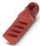
Coding profile for HC-MOD-K... housing