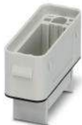
Plastic panel mounting base for modules for a module slot, with PE marking for pos. 1, for snap locking

Please be informed that the data shown in this PDF Document is generated from our Online Catalog. Please find the complete data in the user's documentation. Our General Terms of Use for Downloads are valid ( http://download.phoenixcontact.com )