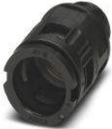
Cable gland, metric thread, IP68/69k protection, straight

Please be informed that the data shown in this PDF Document is generated from our Online Catalog. Please find the complete data in the user's documentation. Our General Terms of Use for Downloads are valid ( http://phoenixcontact.com/download )