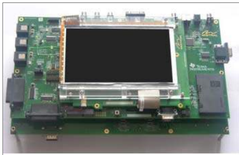
TMDXEVM8148 top view

LINUXEZSDK-DM8148, Linux EZ Software Development Kit (EZSDK) for DM8148 / DM8147 DaVinci(TM) Processors - BETA