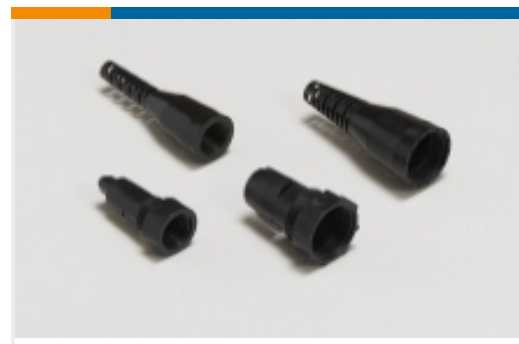
Connector Strain Relief(6)