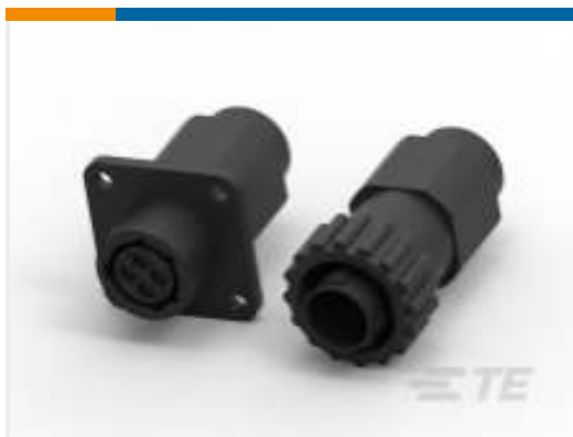
TE Part #796275-1 One-Piece Connector, Sealed, CPC Series 1