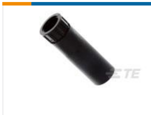
TE Part #54010-1 CPC STRAIN RELIEF,SIZE 11