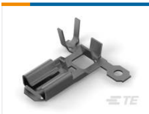
TE Part #936604-1 PL 250 FLAG REC 18-14AWG 0.40X28.0 PTPBR