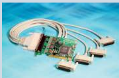
UC-265: uPCI 4xRS232 DB25