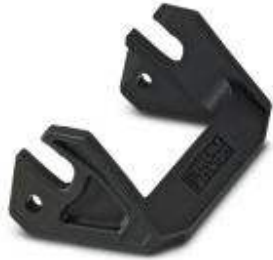
Single locking latch for B10 housing, HC-EVO...AL and HC-STA...AL

Please be informed that the data shown in this PDF Document is generated from our Online Catalog. Please find the complete data in the user's documentation. Our General Terms of Use for Downloads are valid ( http://phoenixcontact.com/download )