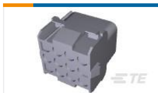
TE Part #926681-1 UNIV.M-N-L.CAP HSG.