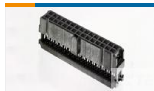
TE Part #2-1393531-6 V23535A3280C101=BKMOD422 FEDER