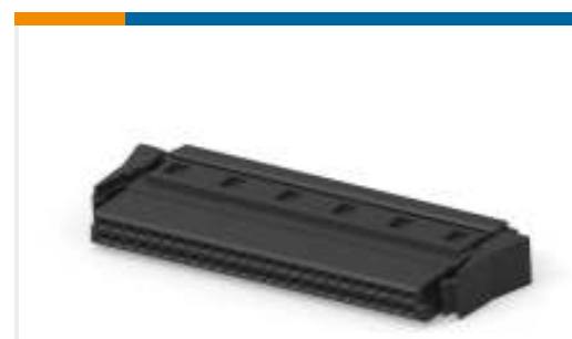
TE Part #214347-E SMCB 50 F AB VW 6-01 VH * 0008 137 E002