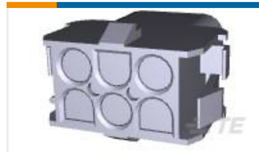
TE Part #1586860-1 06P UMNL CAP HSG, GW