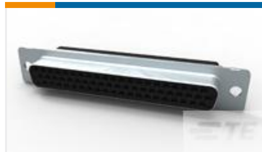
TE Part #1658684-1 HDP-22, RCPT, SIZE 4, 62 POSN