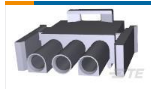
TE Part #2-480700-0 03P UMNL PLUG HSG