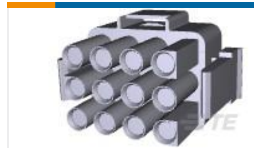
TE Part #770041-1 12P UMNL II PLUG-FRONT 94VO