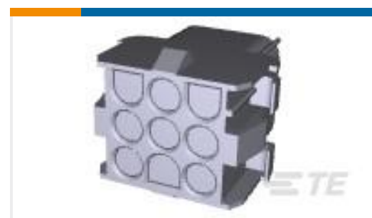
TE Part #927231-7 UMNL 9 WAY CAP HOUSING