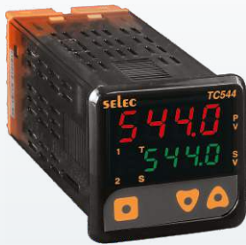
48 x 48 mm