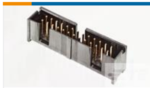
TE Part #5103309-5 A/L LOW PRO HDR 20P VERT BLACK