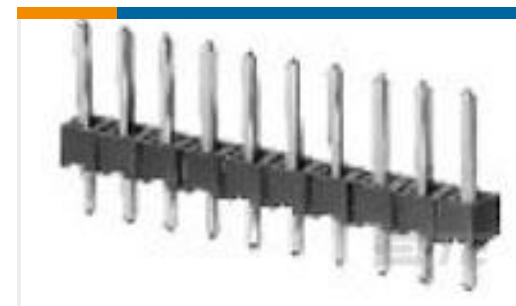
TE Part #5-146274-3 03 MODII HDR SRST B/A .100CL