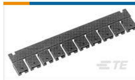
TE Part #2-382811-1 SHUNT, ECON, PHBRN, BLACK