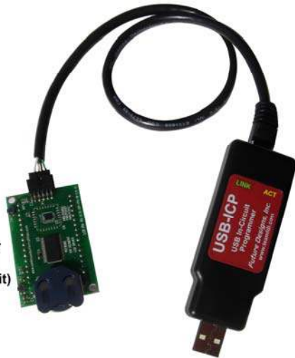
Example User Target Board (Not Part of Kit)

The target connector is a standard 2mm pitch, 10-pin, shrouded header available from numerous suppliers. Shrouded connectors should be utilized in order to protect the pins and ensure proper connector insertion.