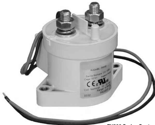
EV200 Series Contactor (CZONKA Relay, Type)