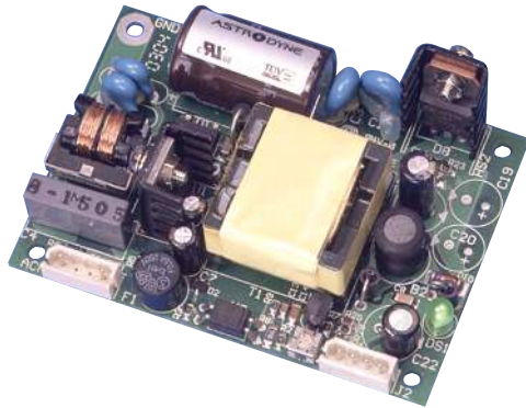
3"W x 2.18"L x 0.93"H