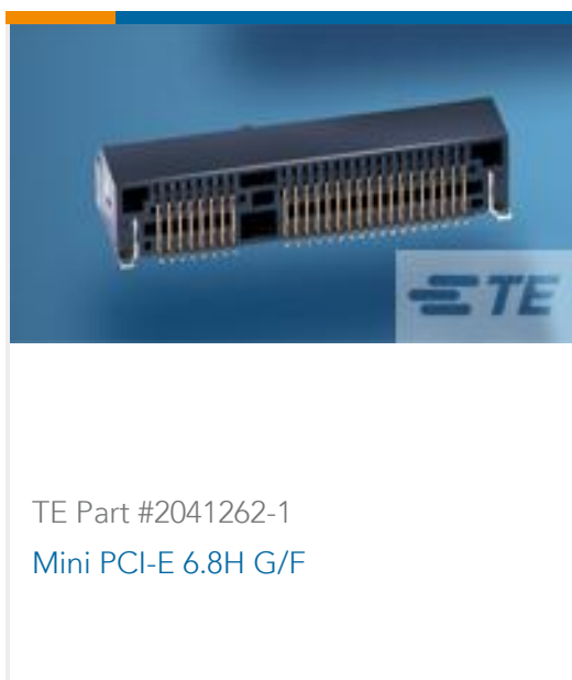
TE Part #2041262-1 Mini PCI-E 6.8H G/F