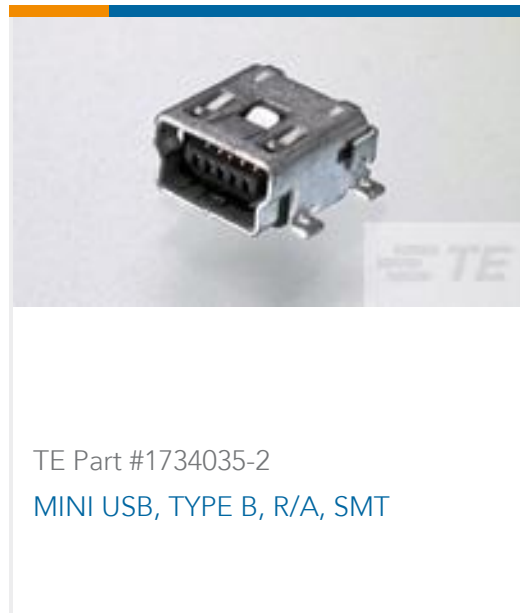
TE Part #1734035-2 MINI USB, TYPE B, R/A, SMT