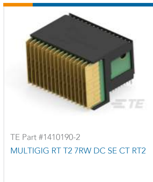
TE Part #1410190-2 MULTIGIG RT T2 7RW DC SE CT RT2