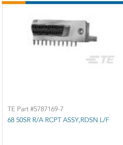
TE Part #5787169-7 68 50SR R/A RCPT ASSY,RDSN L/F