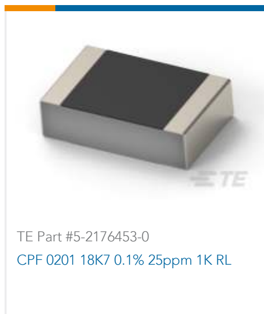
TE Part #5-2176453-0 CPF 0201 18K7 0.1% 25ppm 1K RL