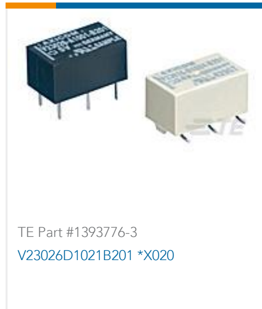
TE Part #1393776-3 V23026D1021B201 *X020