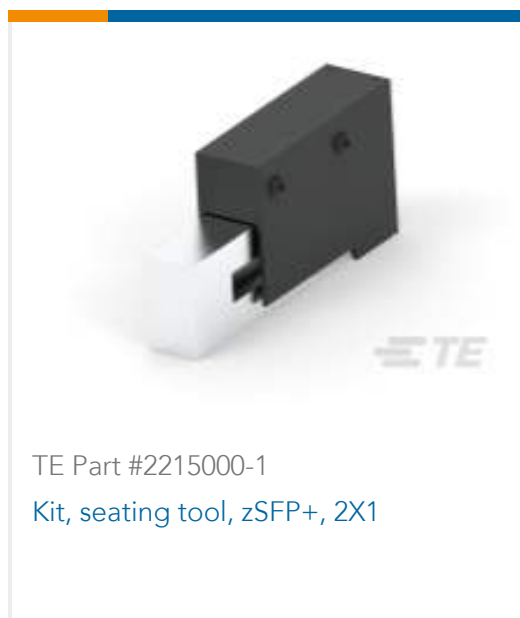
TE Part #2215000-1 Kit, seating tool, zSFP+, 2X1