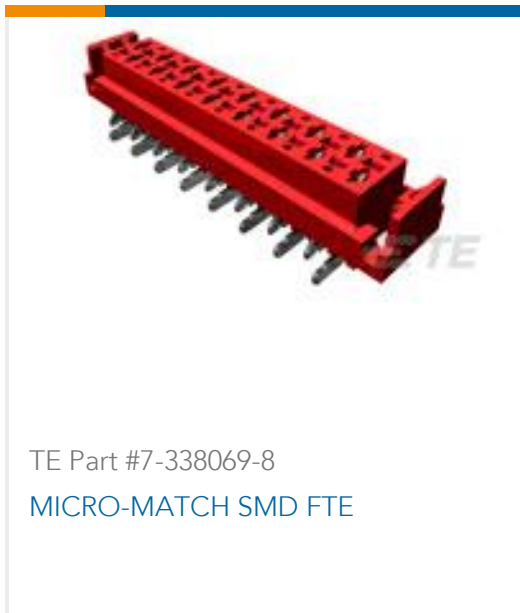
TE Part #7-338069-8 MICRO-MATCH SMD FTE