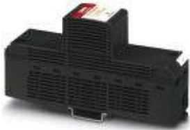
The illustration shows version FLT-PLUS CTRL-0,9

Please be informed that the data shown in this PDF Document is generated from our Online Catalog. Please find the complete data in the user's documentation. Our General Terms of Use for Downloads are valid ( http://phoenixcontact.com/download )