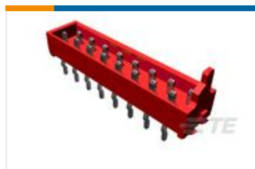
TE Part #7-215464-6 06P.MICRO-MATCH MOB