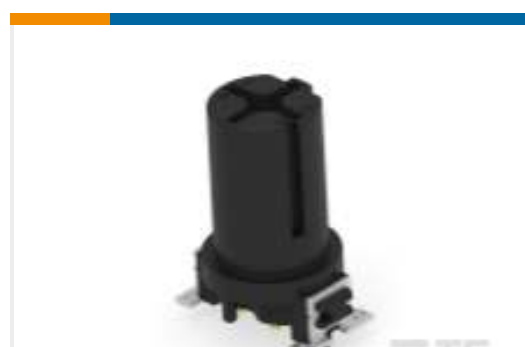
TE Part #474665-E M12 F 4 D H S * 301 17,0 094 *** V 999