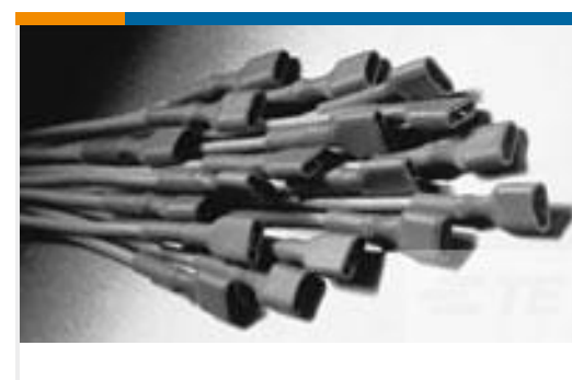
TE Part #0418834001 LSTT-1.6-0-SP