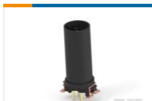
TE Part #484118-E M12 M 5 A H T 3,0 301 17,0 094 **** 0