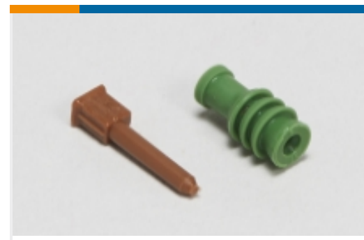
Automotive Seals & Cavity Plugs(32)