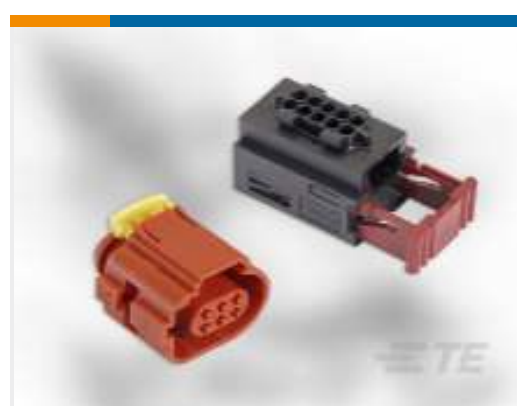
TE Part # CAT-T4827-CH8172 Timer Connector Housing