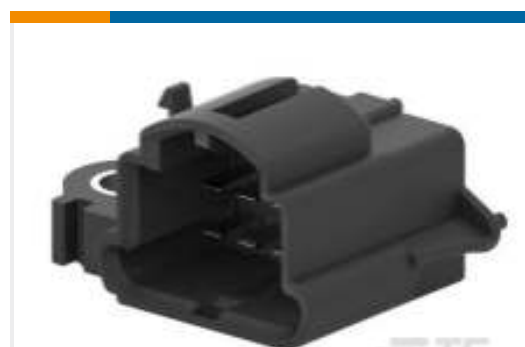
TE Part #963357-2 Low & Medium Power Header