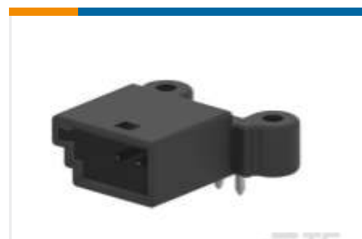
TE Part #1318853-2 Signal Header