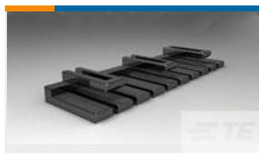
TE Part #1969443-5 EP 2.5 TPA Retainer, 5 Pos