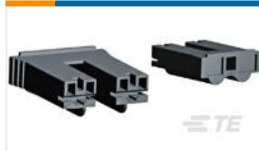
TE Part #521229-1 PL 250 HOUSING RECEPTACLE NYLON 6/6