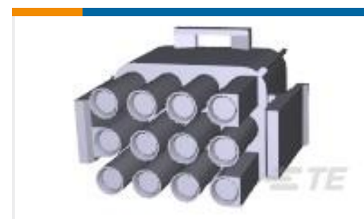
TE Part #794742-1 12P UMNL PLUG HSG NATL