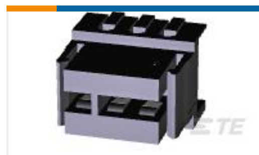
TE Part #284865-3 DUOPLUG side lock., female con