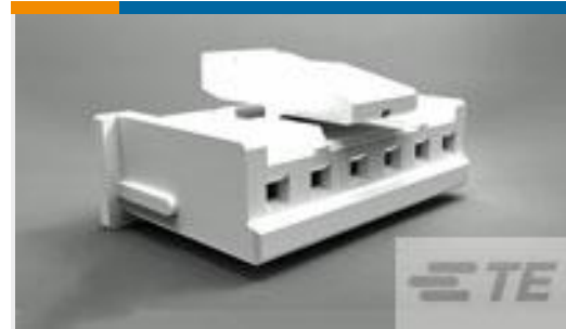
TE Part #1-1969442-3 EP 2.5 TPA Housing, 13 Pos