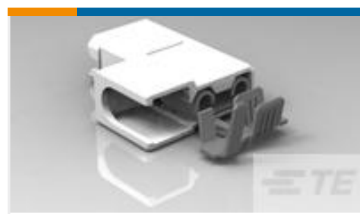
TE Part #521282-2 ULTRA-POD 250 ASSY REC 18-14 AWG TPBR