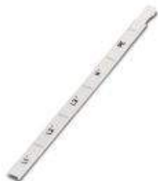
Zack marker strip, white, For terminal block width: 18 mm

Please be informed that the data shown in this PDF Document is generated from our Online Catalog. Please find the complete data in the user's documentation. Our General Terms of Use for Downloads are valid ( http://download.phoenixcontact.com )