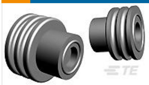
TE Part #1394512-1 EINZELLEITDICHTG,BL