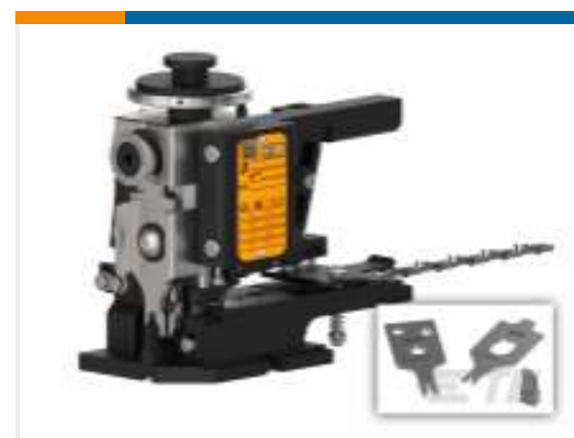
TE Part # 7-4150059-1 OCEAN-2.0-APPLICATOR-E-140F