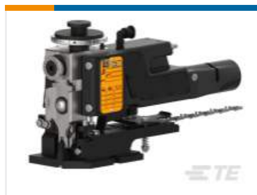
TE Part # 4150059-2 OCEAN-2.0-APPLICATOR-E-140F