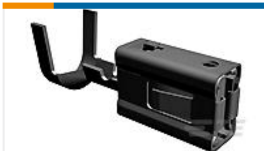
TE Part #1241416-3 AMP MCP 6.3/4.8K, CONTACT, SWS