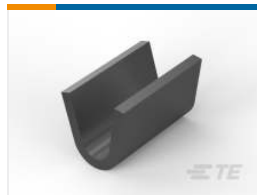
TE Part # 140723-2 SPLICE 22-16 AWG .02 TPBR