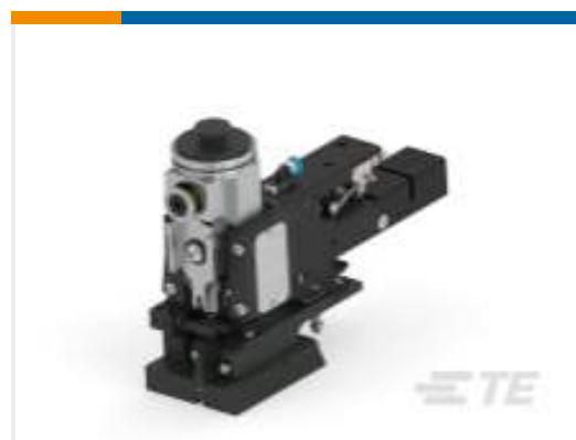
TE Part # 4150059-1 OCEAN-2.0-APPLICATOR-E-140F