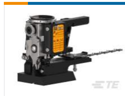
TE Part # 2-4150059-1 OCEAN-2.0-APPLICATOR-E-140F