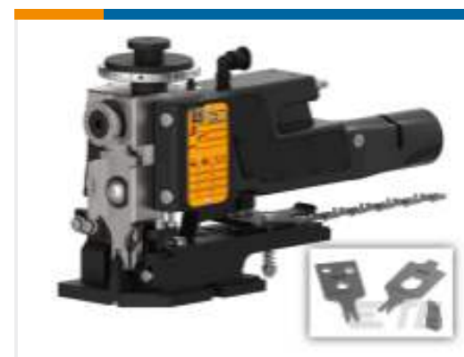
TE Part # 7-4150059-2 OCEAN-2.0-APPLICATOR-E-140F