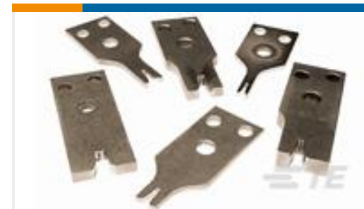
TE Part #679440-6 CRIMPER, INS. .125