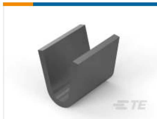
TE Part # 160660-2 SPLICE 22-18 AWG .013 TPBR