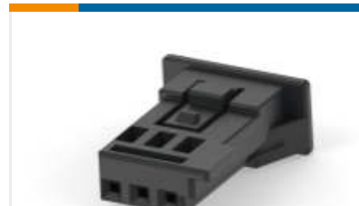
TE Part #1-929089-1 3POS MQS FFC REC COD A