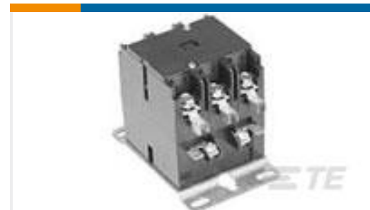
TE Part #7-1611011-4 3100-30U9999CY=30A 3P 208/240V