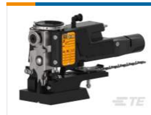
TE Part # 2-4150059-2 OCEAN-2.0-APPLICATOR-E-140F