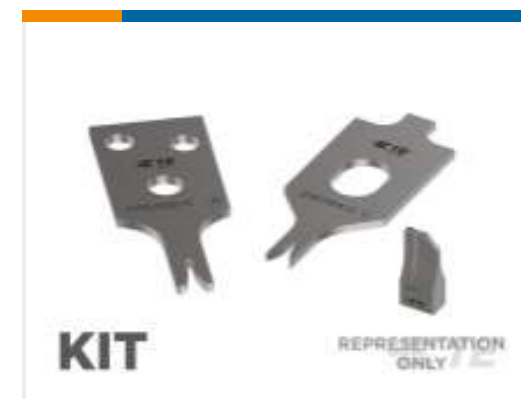
TE Part # 7-4150059-7 OCEAN_2.0_SPARE_PART_KIT-140F