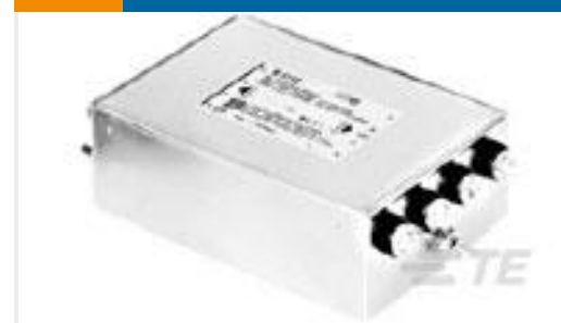
TE Part #6609977-3 36AYA6A = F7747A