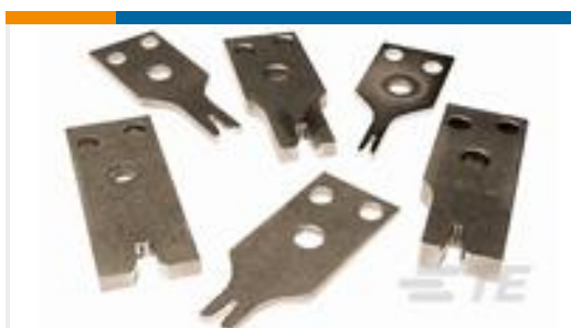
TE Part #9-657555-1 DRAHTCRIMPER