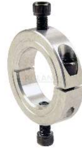
*Additional hardware #01 included