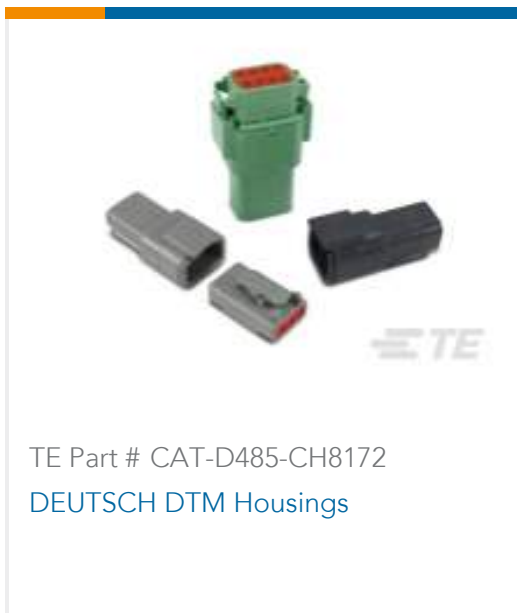
TE Part # CAT-D485-CH8172 DEUTSCH DTM Housings