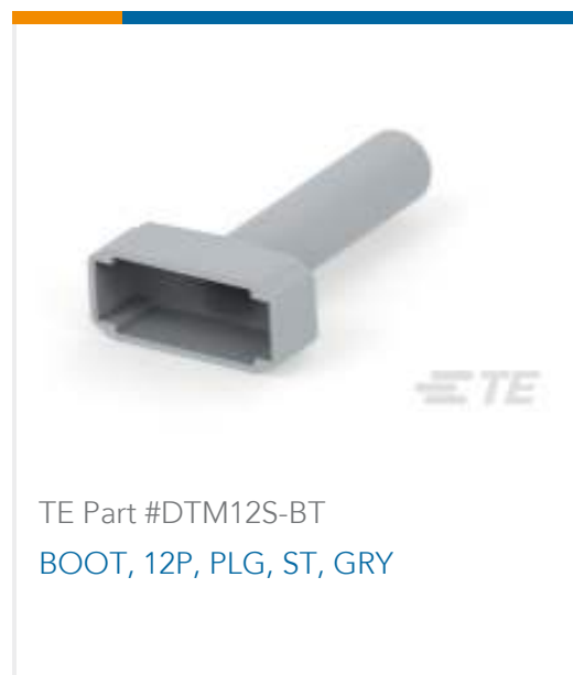
TE Part # DTM12S-BT BOOT, 12P, PLG, ST, GRY