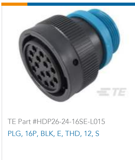
TE Part # HDP26-24-16SE-L015 PLG, 16P, BLK, E, THD, 12, S