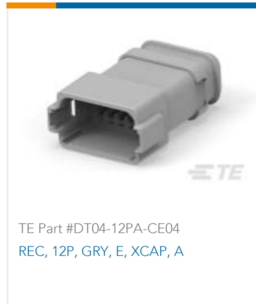
TE Part # DT04-12PA-CE04 REC, 12P, GRY, E, XCAP, A