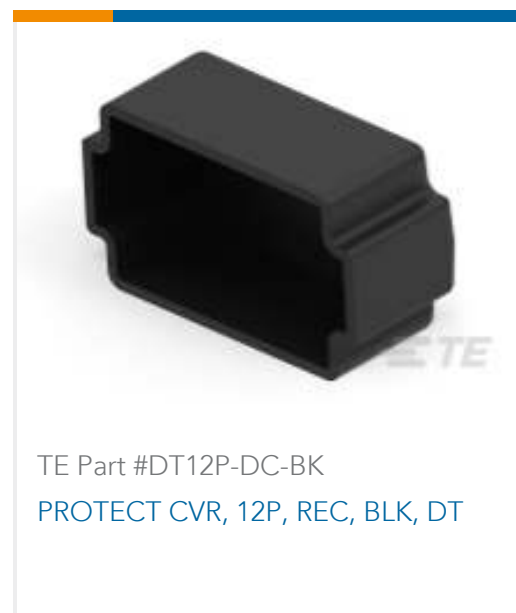
TE Part # DT12P-DC-BK PROTECT CVR, 12P, REC, BLK, DT