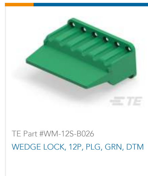
TE Part # WM-12S-B026 WEDGE LOCK, 12P, PLG, GRN, DTM