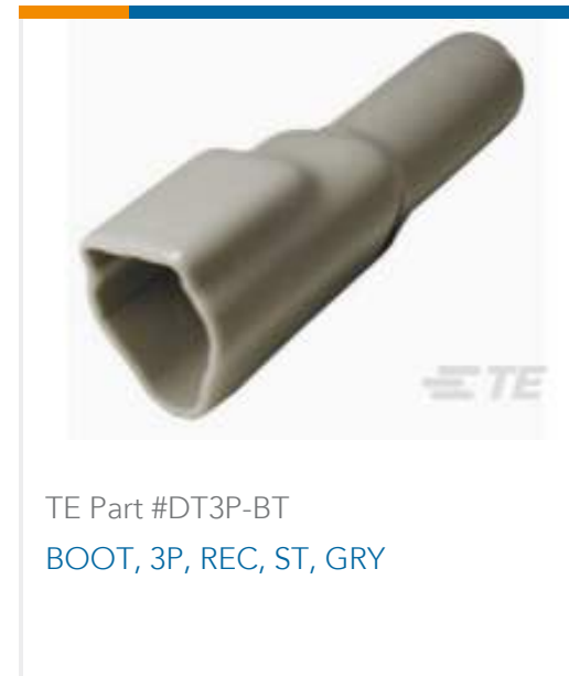
TE Part # DT3P-BT BOOT, 3P, REC, ST, GRY