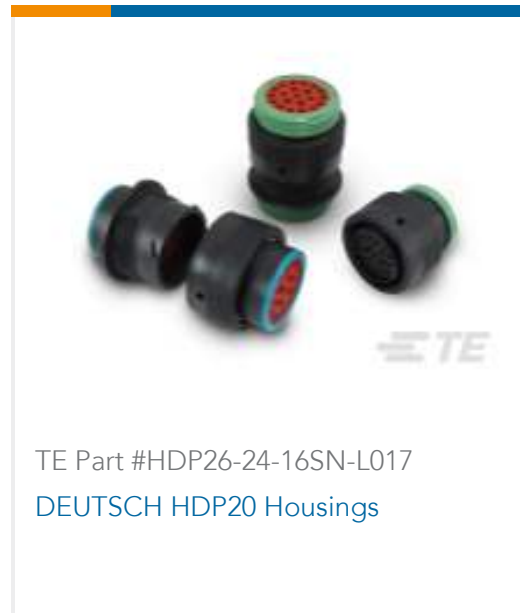
TE Part # HDP26-24-16SN-L017 DEUTSCH HDP20 Housings