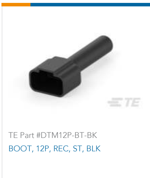
TE Part # DTM12P-BT-BK BOOT, 12P, REC, ST, BLK