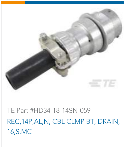
TE Part # HD34-18-14SN-059 REC, 14P, AL, N, CBL CLMP BT, DRAIN, 16, S, MC